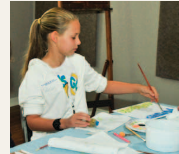
2010 Color of Music program organized in cooperation with the New Braunfels Art League.

The Mid-Texas Symphony Guild chapters in Seguin and New Braunfels support the orchestra through fund raising, educational programs, and providing hospitality for the orchestra. Each chapter sponsors a Debutante program, a Cotillion program, and a Color of Music art program. If you would like information about joining one of the Guild chapters, please contact the Symphony office.